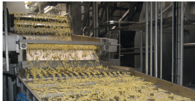
Agristo's french fries production needs a reliable and continuous gas supply.

V&SH appreciated the local service support package including on-site instructions and all necessary tools (i.e. ovality meters, positioners, rotary peelers, welding machines, GNSS receivers, ...). The additional security of an overall documentation system allowed not only V&SH to prove the quality of its installation service to its customer, but also Agristo to trace the gas pipe line. As a positive side effect, the installation team of V&SH appreciated the easy assembly of the ELGEF Plus couplers, which allowed it to finish the job even under tropical installation conditions (30°C) in due time.