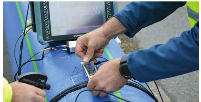
100% Ultrasonic NDT testing of the d500 mm butt fusion joints in the HDD passage.