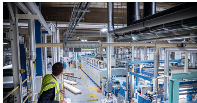
The COOL-FIT piping systems could be installed without interrupting mask production.

Thanks to the continuous support of GF Piping Systems, SENFA was able to focus on its day-to-day business and mask production – of national interest. From May to October 2020, 60 million fabric masks have already been made. By allowing fabric mask production to run without interruption and relying on the COOL-FIT piping system, SENFA can now focus on the production of other types of masks.