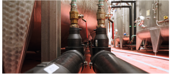
The 3-in-1 construction of weldable plastic – consisting of medium-carrying pipe, insulation and robust jacket – reduced installation time to a minimum.

Thanks to the lower thermal conductivity of plastic and the robust foam insulation, COOL-FIT is particularly energy-efficient and reliable. In the long term, these characteristics ensure safe, corrosion-free and cost-saving operations of the cooling of the wine tanks. The 3-in-1 construction of weldable plastic – consisting of medium-carrying pipe, insulation and robust jacket – reduced installation time to a minimum.