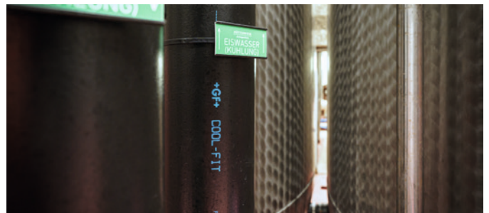
The highly resistant HDPE outer jacket protects the insulation foam and provides an additional layer of insulation.