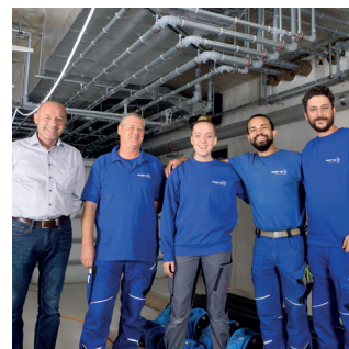
Steger plumbers are professionals at installing INSTAFLEX.