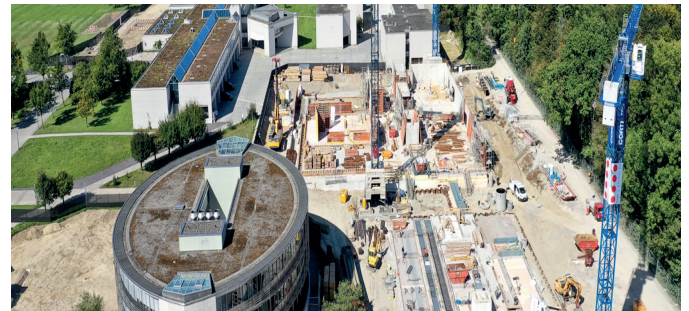
Expansion of the second largest weapons site in Switzerland. Image title page: VIZE architectural rendering. Architecture: Baumschlagler Eberle Architects

Telephone +41 (0) 12 345 678 mail@georgfischer.com www.gfps.com